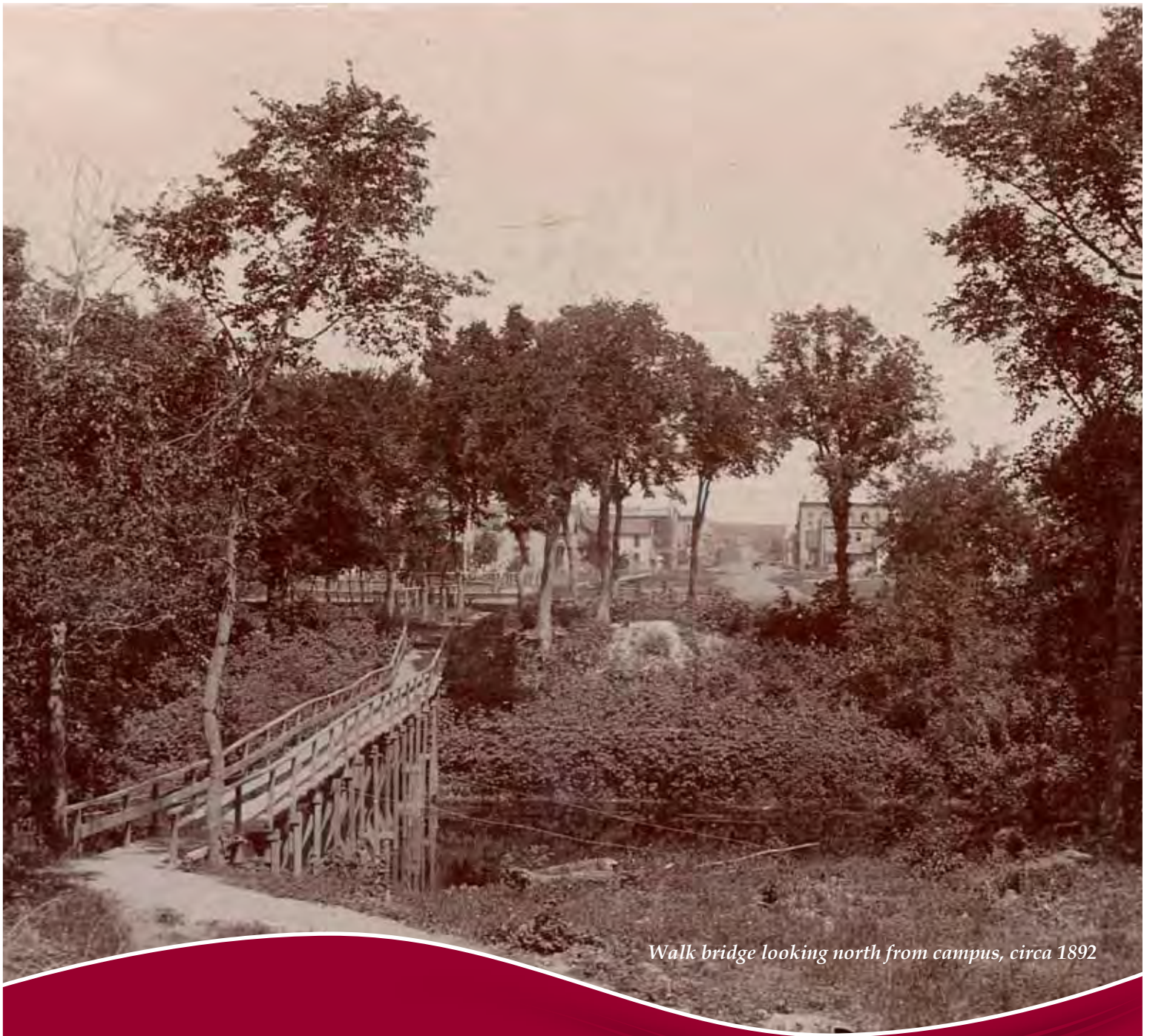
Walk bridge looking north from campus, circa 1892