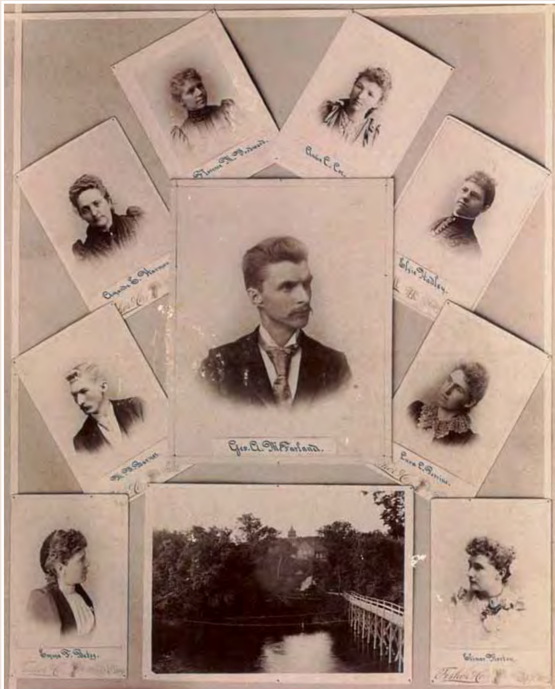
State Normal School faculty and walk bridge, early 1890s